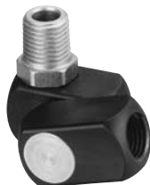
Dynaswivel® Swivels 360° at two locations which allows an air hose to drop straight to the floor, no matter how the tool is held. • 94300 1/4" NPT