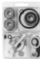
96529 Motor Tune-Up Kit: • Includes assorted parts to help maintain and repair motor.