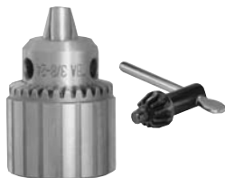
53032 – 1/4" Drill Chuck Includes: 53052 Mated Chuck Key